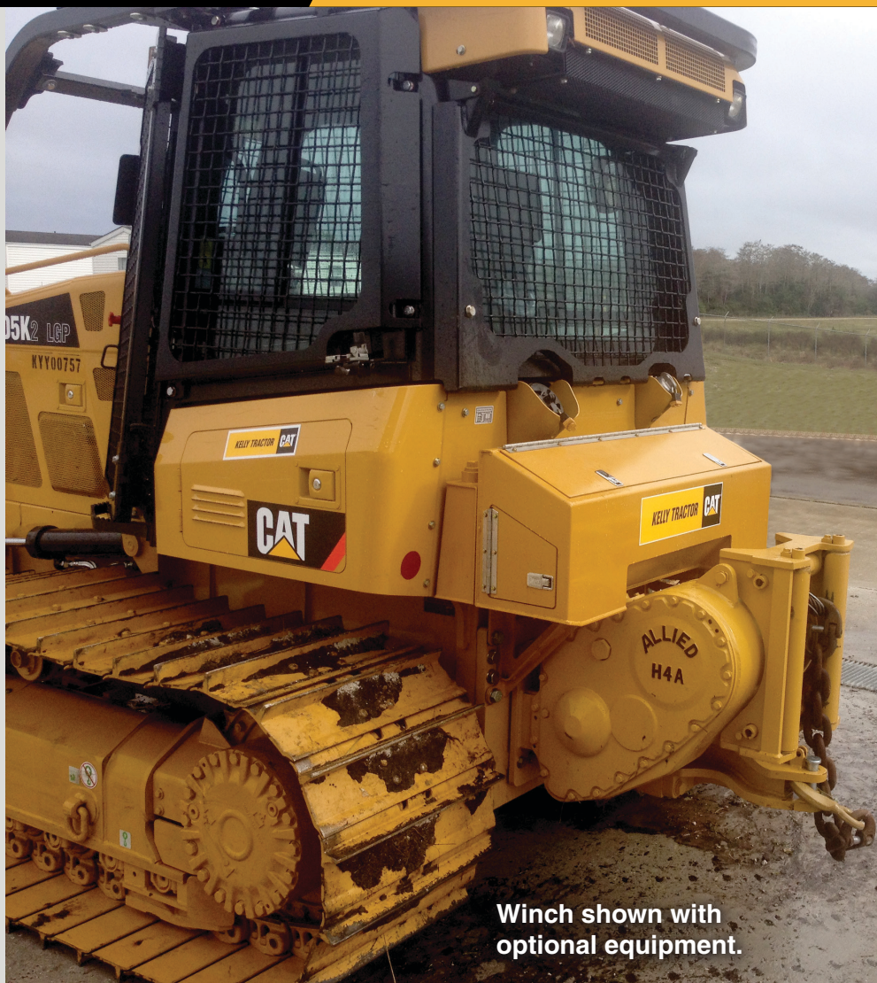
Winch shown with optional equipment.