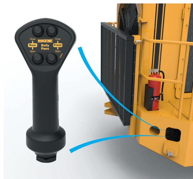
Figure 2-10-2 Joystick

When done, use the joystick to close (raise) the belly pans. Reinstall the capscrews and washers and torque per 80-1057 in section 10 of your service manual.