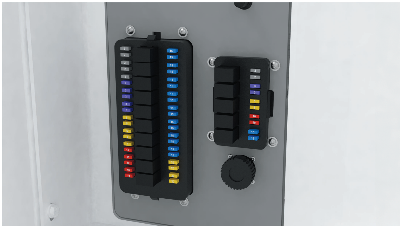
Figure 2-9-1 Fuse Panel