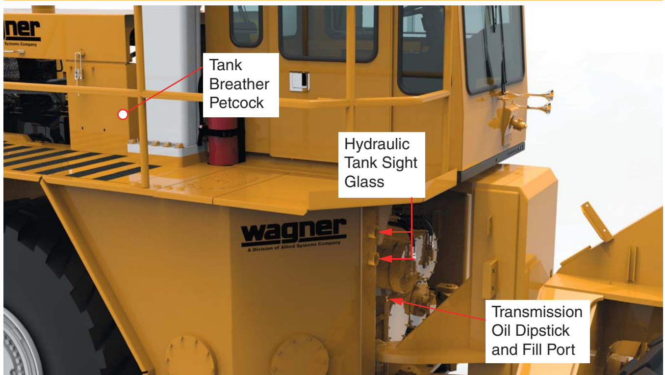
Figure 4-2-5 Hydraulic Oil and Transmission Oil Maintenance Locations