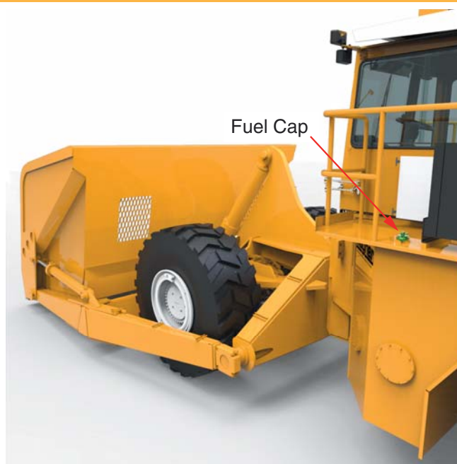
Figure 4-2-4 Fuel Cap Location