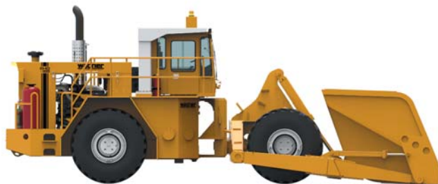
Figure 4-2-6 Maintenance Position

The hydraulic oil level must be checked with the bucket in the maintenance position (hoist cylinder extended, bucket rolled back; see Figure 4-2-6). The oil level should be at or near the “H” (high) mark on the sight glass. Fill with approved hydraulic fluid as required (See Lubricant Specifications Chart, Section 5). Do not overfill.