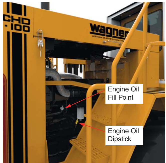
Figure 4-2-2 Engine Oil Maintenance Points