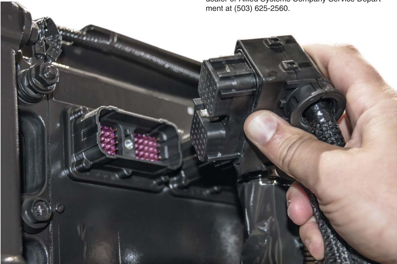
Figure 5-1-3 Disconnect ECM(Electronic Control Module)

For questions or concerns, please contact your local dealer or Allied Systems Company Service Department at (503) 625-2560.