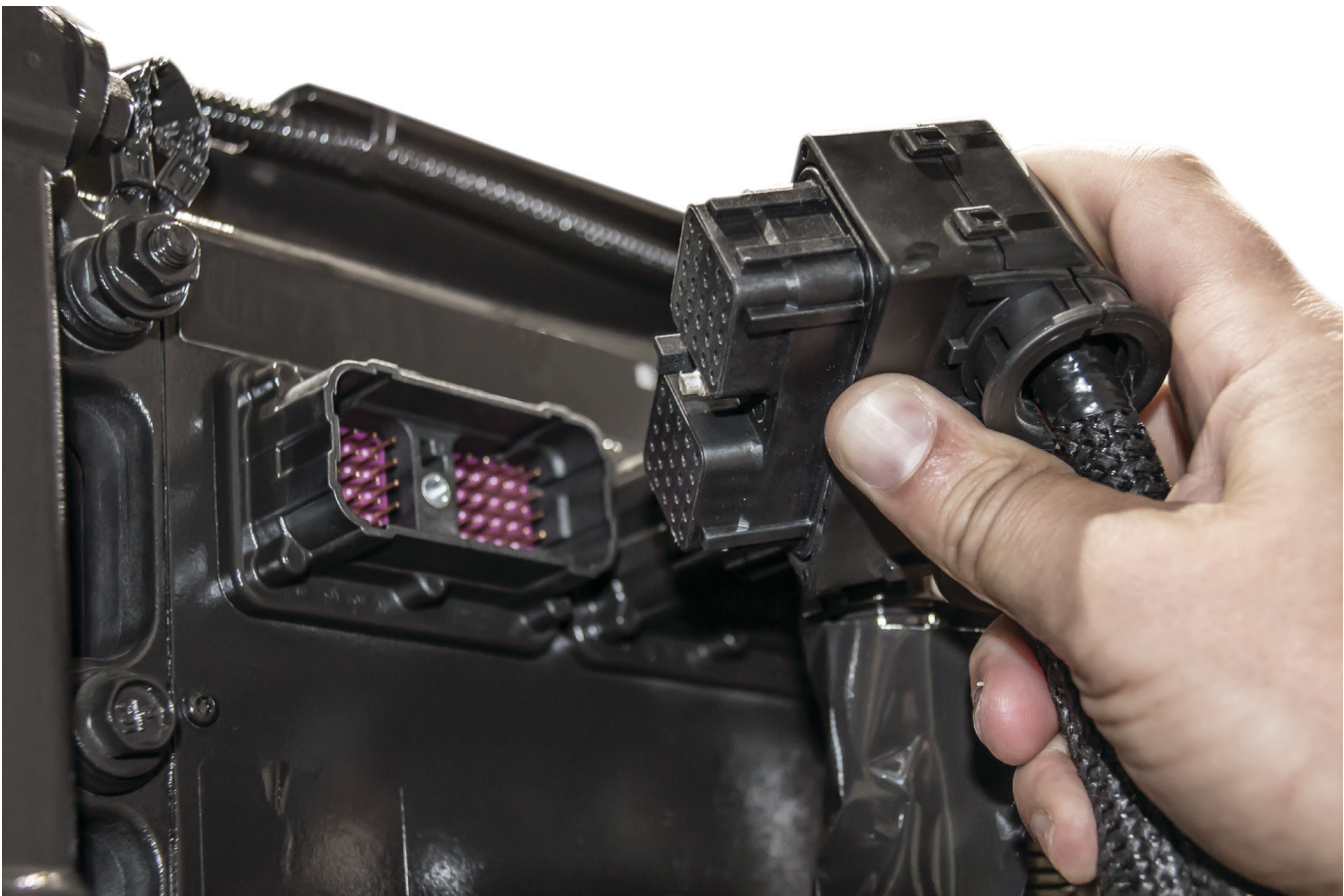
Figure 5-1-2 Disconnect ECM(Electronic Control Module)

For questions or concerns, please contact your local dealer or Allied Systems Company Service Department at (503) 625-2560.