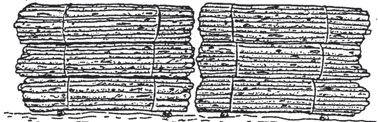
Figure 4-11-1 Non-Tapered Bundles