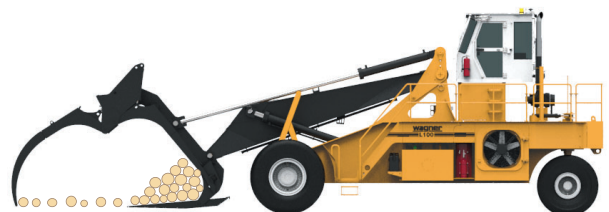
Figure 4-7-3 Retrieving