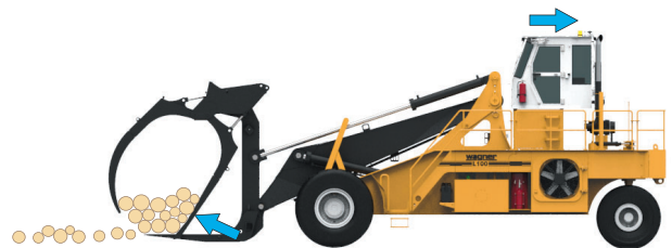
Figure 4-7-2 Spreading