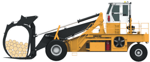
Figure 4-7-1 Ready to Spread