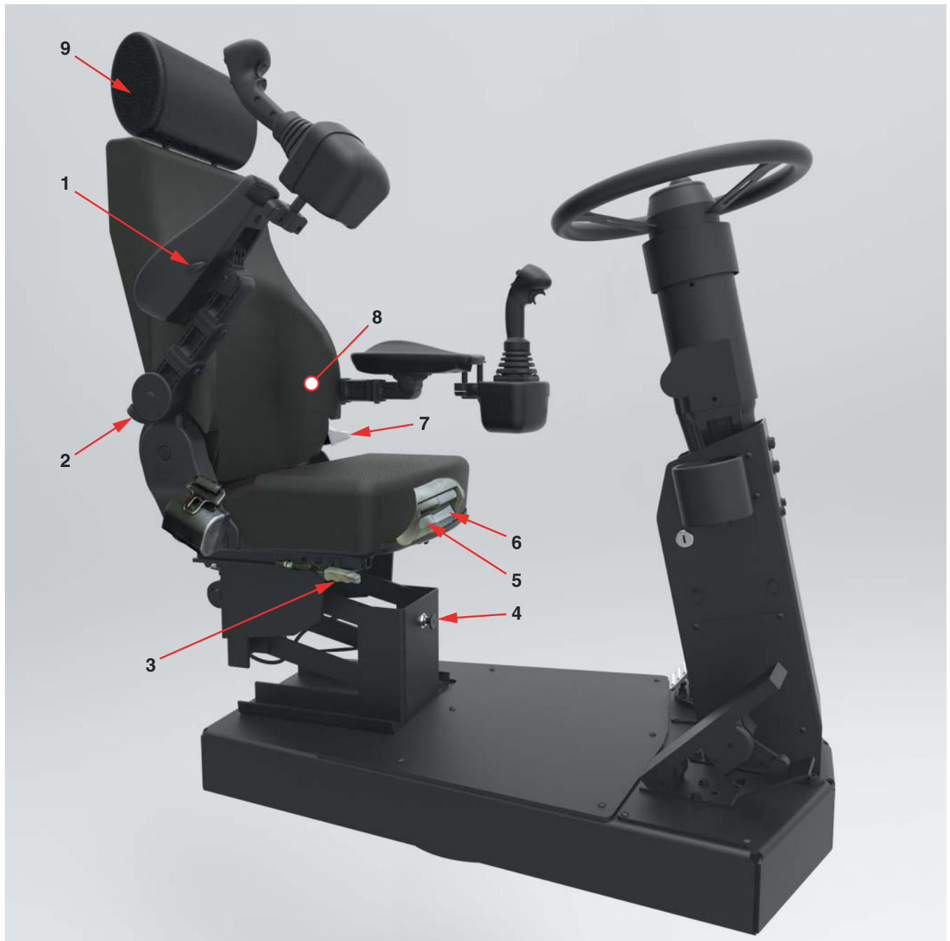
Figure 2-5-1 Operators Seat