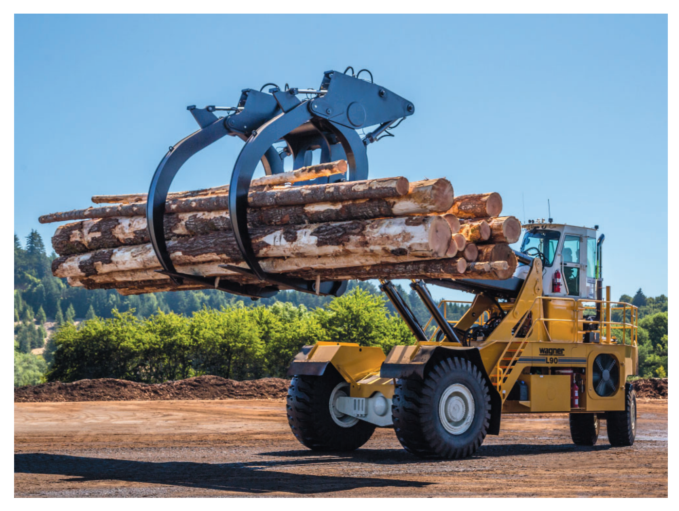
Figure 1-1-1 The Lumberjack, Workhorse of the Logging Industry (Model L90 Shown)

This manual is your guide to correct operation of the Wagner Lumberjack. Become familiar with it, understand it, and use it. Read all instructions carefully prior to operation. They will help you understand the unit, its capabilities, and its limitations.