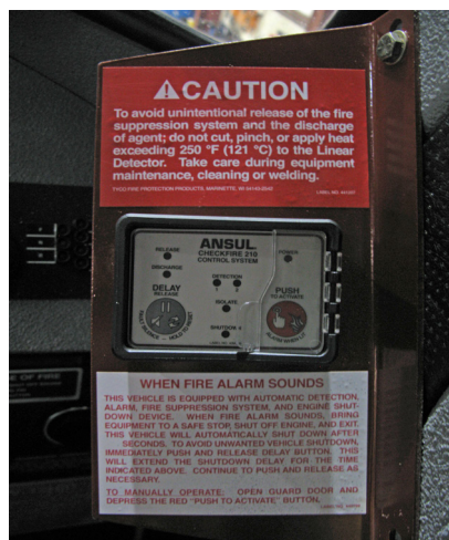
Figure 4-14-1 CHECKFIRE 210 ICM

The red button “PUSH TO ACTIVATE” on the CHECKFIRE 210 ICM and the actuator at ground level will both set off the system.