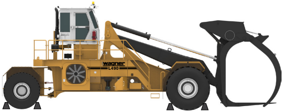
Logstacker shown parked in Service Position (4WD Model Shown)

Before performing maintenance or service under the machine: