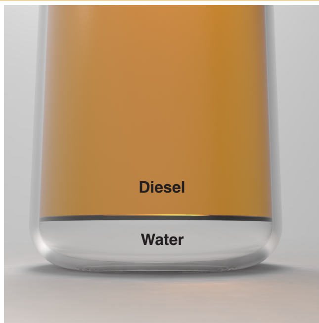
Figure 2 Analyze the Sample

Make sure the tank is completely clean and dry before refilling.