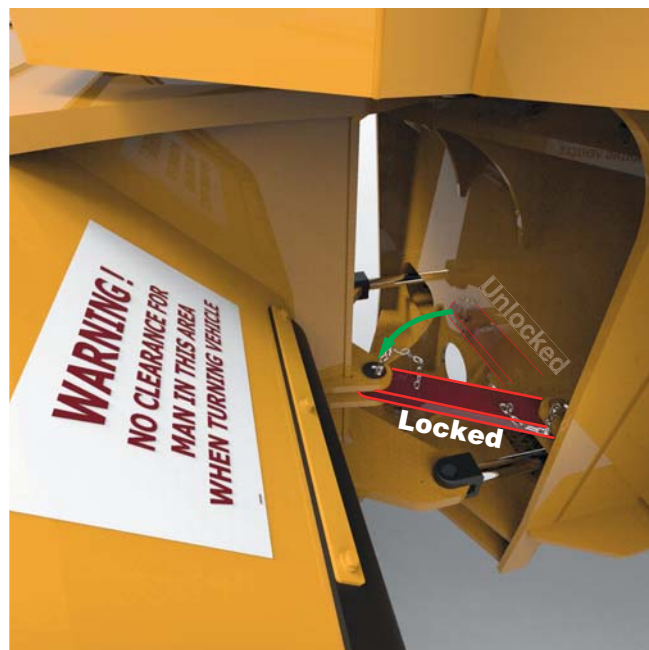
Figure 1 Articulation Lock, L490