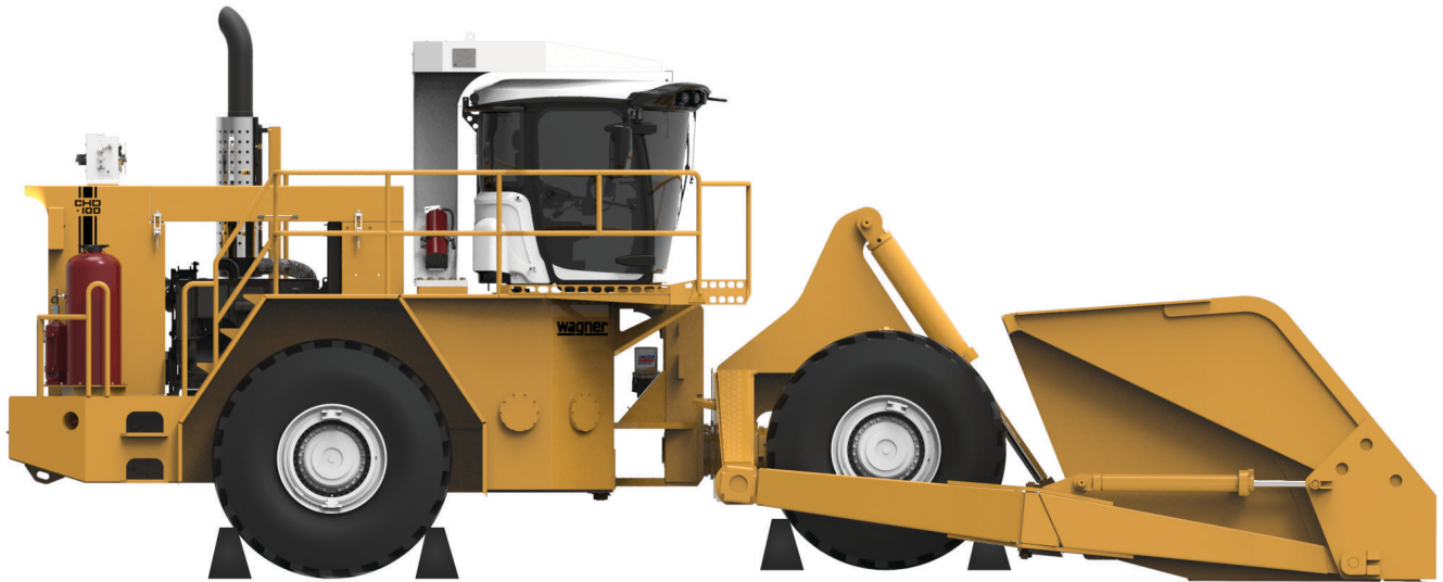
Figure 1 Service Position (CHD100 Shown)