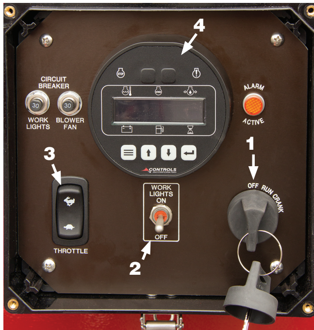
Figure 1. Control Box for: 270/370 Engine Balers

The control box (see Figure 1) is located at the front of the engine. It is used to start and stop the engine, turn on and off the work lights and monitor engine functions.