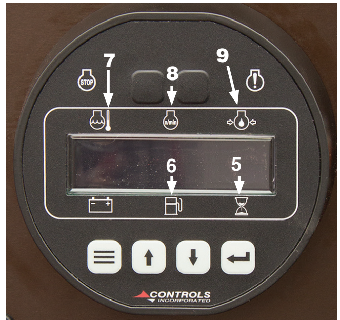
Figure 2. Control Box Digital Display

For slow speed, press lower half of switch (indicated by turtle symbol).