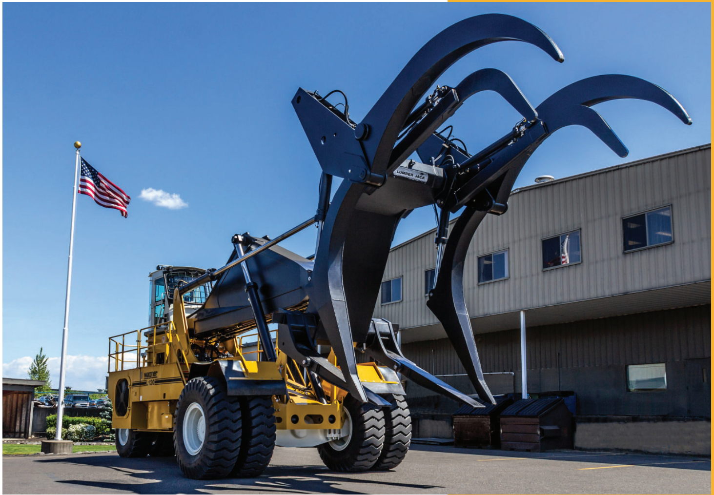
Shown with optional service bay guard package.