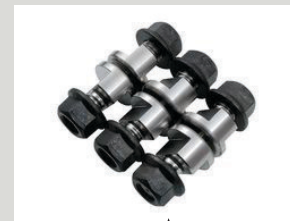
Shear Bolt Fuse Kit (pn: 589846)