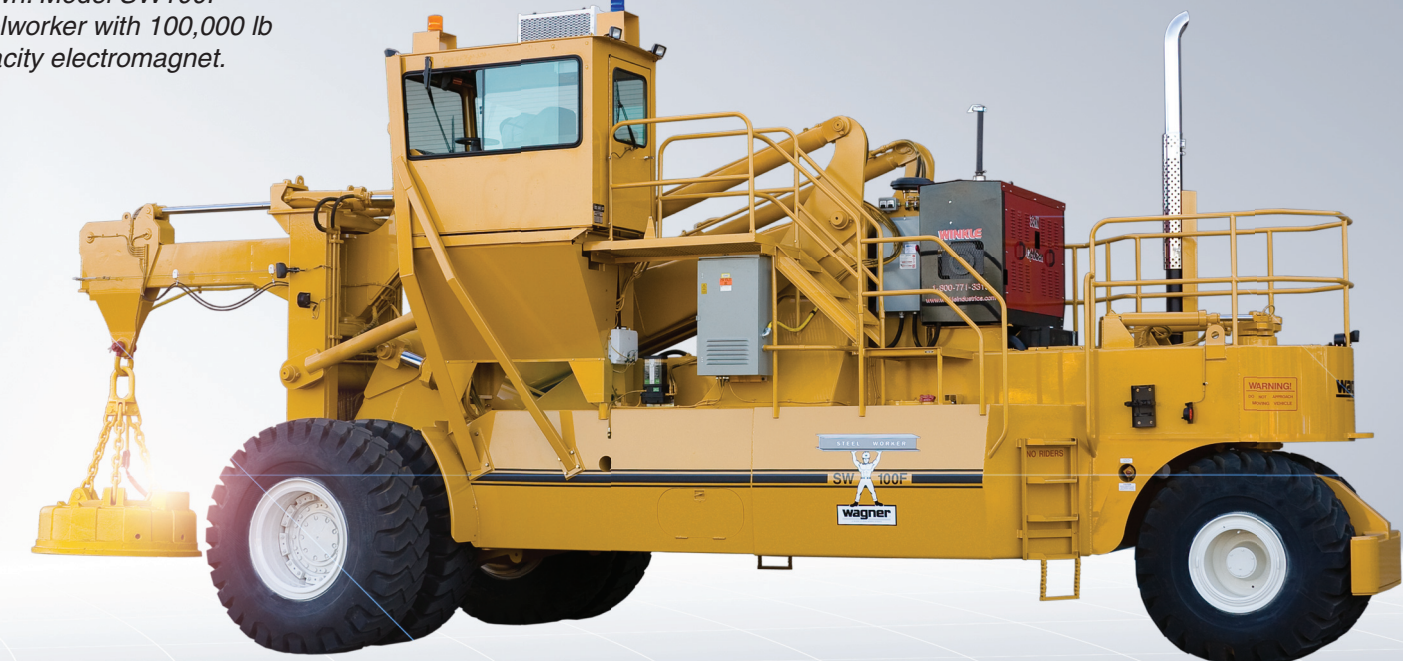
Shown: Model SW100F Steelworker with 100,000 lb capacity electromagnet.

Leaders in engineering and manufacturing of specialized heavy lift and handling equipment.