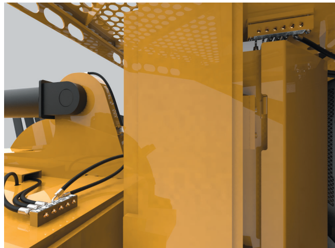
Figure 2 Optional Central Lube Points

Units with the optional central lube installed may be lubricated at the manifolds accessible near the swivel on the left side of the machine. See Figure 2. These points provide remote access to all lube points listed above, except for the drivelines. Those will still need to be lubricated at the drivelines themselves.