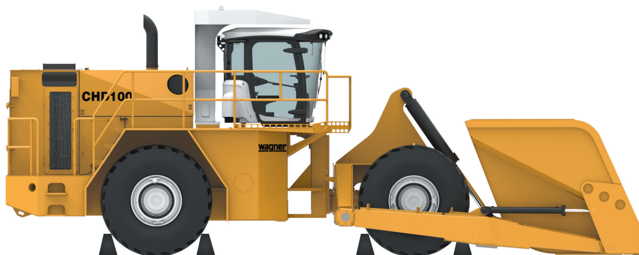
Figure 1 Service Position (CHD100 Shown)