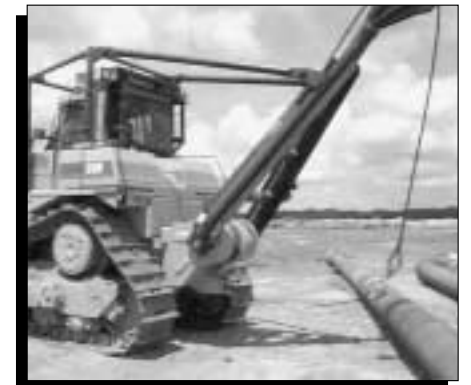
The W12E winch mounted behind the Cat D9R also supports a boom arrangement for lifting lengths of pipe. Electronic control gives excellent control over the position of the pipe as it is lowered.

The winch has been operating now for three months. The design and implementation are well done, and the customer is very satisfied.