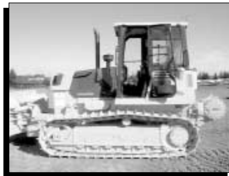
The Allied W3C winch is a great addition to the Komatsu D39 KomStat, for applications ranging from logging to oilfield work and self-rescue.

Allied offers PTO-driven winches for several brands of hydrostatic dozers, including Caterpillar, John Deere, and now Komatsu.