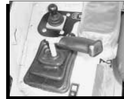
The electronic joystick winch control is much smaller than the traditional manual handle, and requires almost no hand pressure to move the control lever.

processor sits between the joystick handle and the solenoids, to convert handle position information into the appropriate valve position. A major design goal of the electronic control system was to provide the operator with greatly improved inching capability, the ability to control line position to within a fraction of an inch. A related secondary goal was to reduce roll-back to zero. Roll-back is the tendency of the cable under load to play out a small bit before it starts to reel in when operating in line-in position. Winch Engineer Eric Bracht explored many